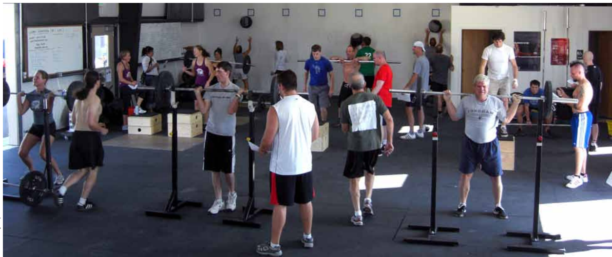
Members of Flatirons CrossFit volunteered for a non-competitive eight-week study in which their athletic performance and their body composition and blood profile would be evaluated.