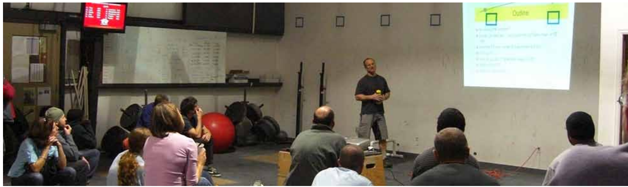
Before the study, all participants were given a lecture on nutrition to ensure they understood Paleo/Zone protocols.